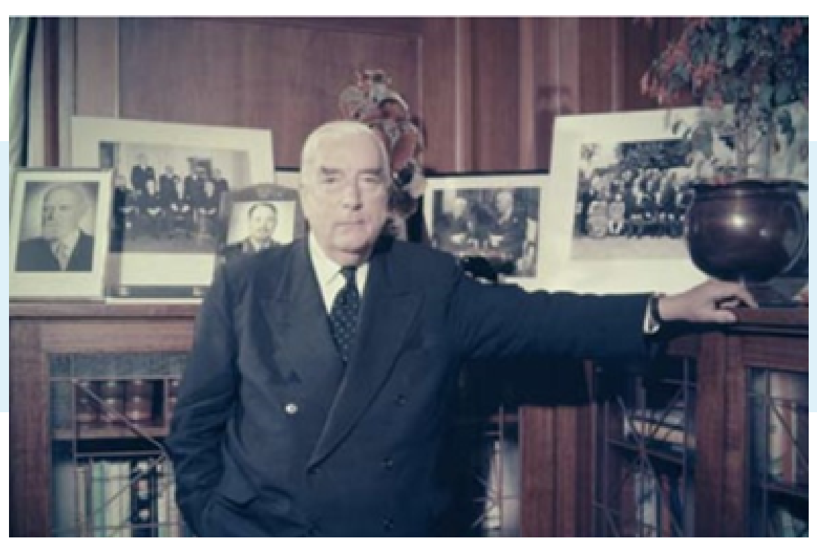
Source: Prime Minister Robert Menzies in his office, April 1960. National Archives of Australia.

Both the new party and Menzies himself were vindicated in 1949 when the Liberal Party won the election and Menzies was sworn in as Prime Minister of Australia for the second time. His re-election was an incredible comeback and he proved to be an able leader for the next sixteen years. In all, Menzies served as Australian prime minister for eighteen years and one hundred and sixty-seven days.