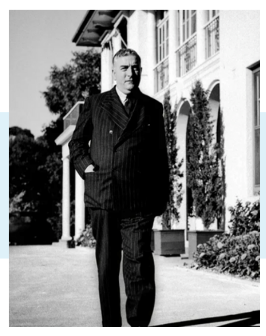
Source: Robert Menzies takes up residence at The Lodge in Canberra on 24 May 1939.

Menzies should also be remembered for being the prime minister who informed the Australian people via radio that the nation was at war with Germany on 3 September 1939.